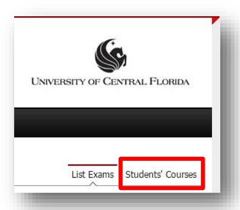
Figure 4: Screen shot on Alternative Testing page. Options: List Exams, Students' Courses

1. To review exam requests, select the Students' Courses tab in the upper right-hand corner of the Alternative Testing page, as shown in Figure 4.